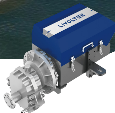
E-engine + Gearbox